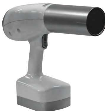
| HAND HELD X-ray Generator

Our Dental X-ray generators are configurable to your exact need.