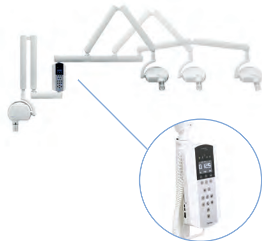
| WALL MOUNT Xmind timer