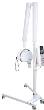
| STAND Mobile dental v2