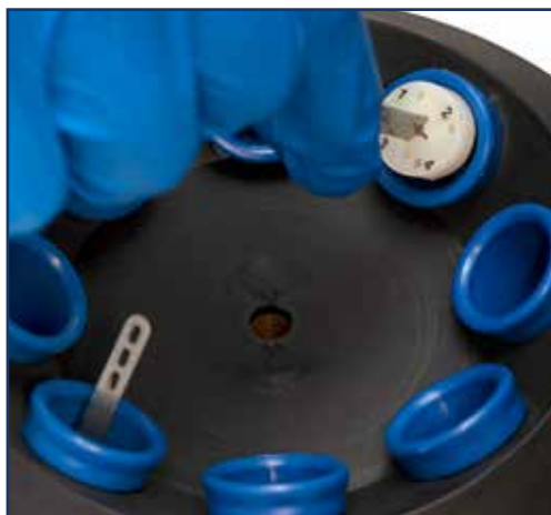
Insert the carrier in the blue tube sleeves.