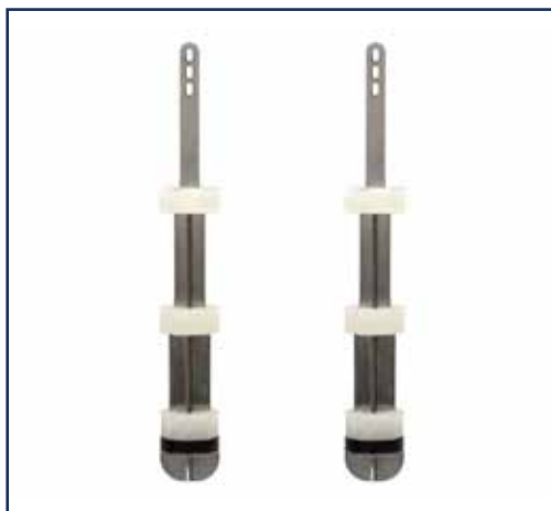
Insert capillaries in the Crit Carrier.